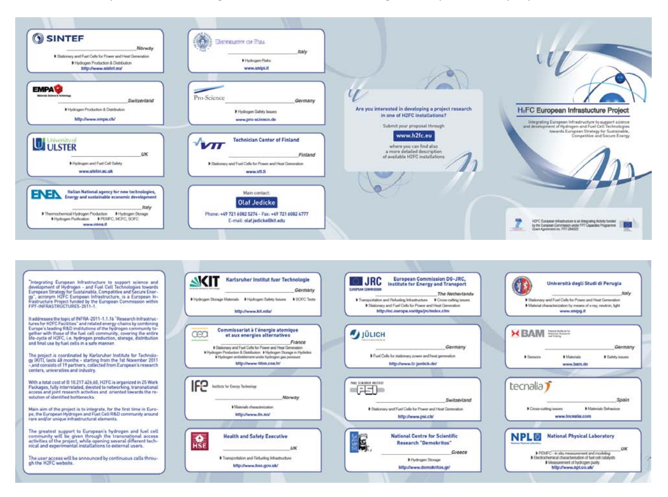
Figure 2: Leaflet for promotion of first and second and third call

Each partner uses their individual Email lists to send out information about the opening of the first call. Additionally the leaflet arranged to the first call was designed for promotion purposes: